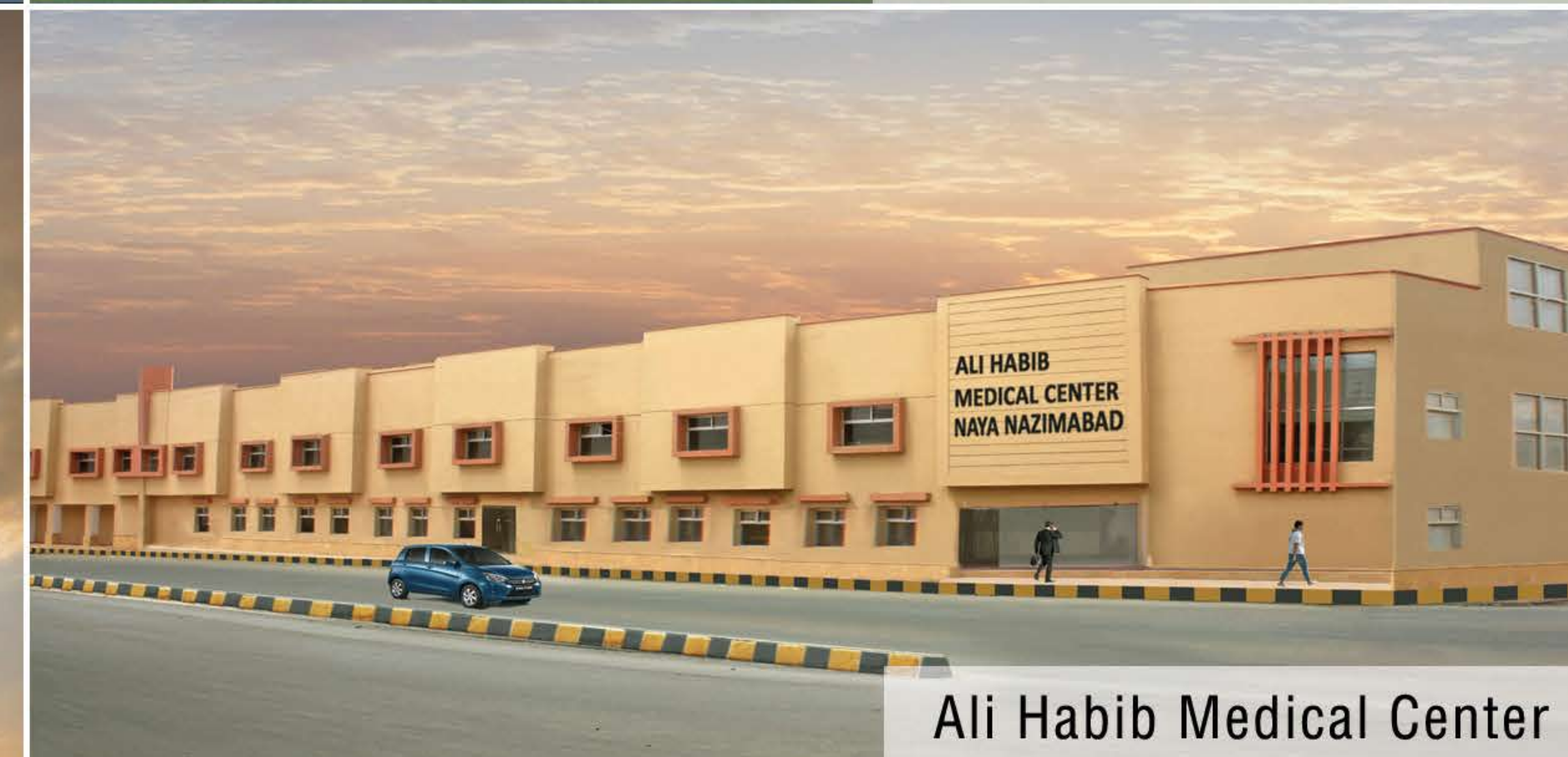
Ali Habib Medical Center